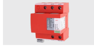
DEHNventil M2 TNC 255 FM

Lightning impulse current (10/350 \mu s) [L, N-PE] ( I_{imp} ): 25 kA