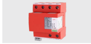
DEHNventil M2 TNS 255 FM

Lightning impulse current (10/350 \mu s) [L-N]/[N-PE] ( I_{imp} ): 25 / 100 kA