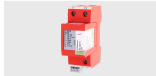
DEHNventil M2 TN 255 FM

Lightning impulse current (10/350 \mu s) [L-N]/[N-PE] ( I_{imp} ): 25 / 50 kA