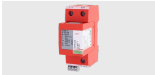
DEHNventil M2 TT 2P 255 FM

Lightning impulse current (10/350 \mu s) [L-PEN] ( I_{imp} ): 25 kA